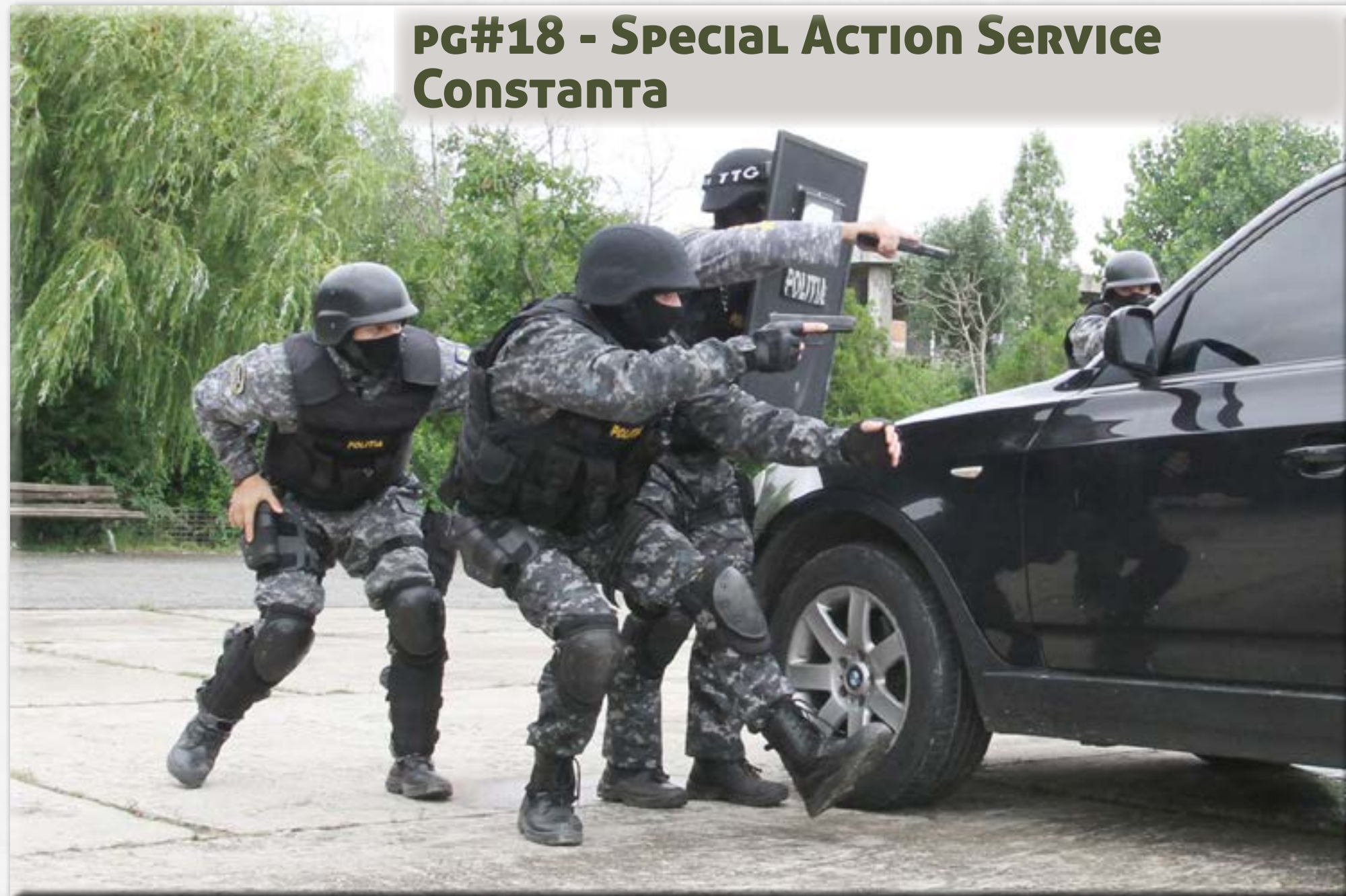
pg#18 - Special Action Service Constanta