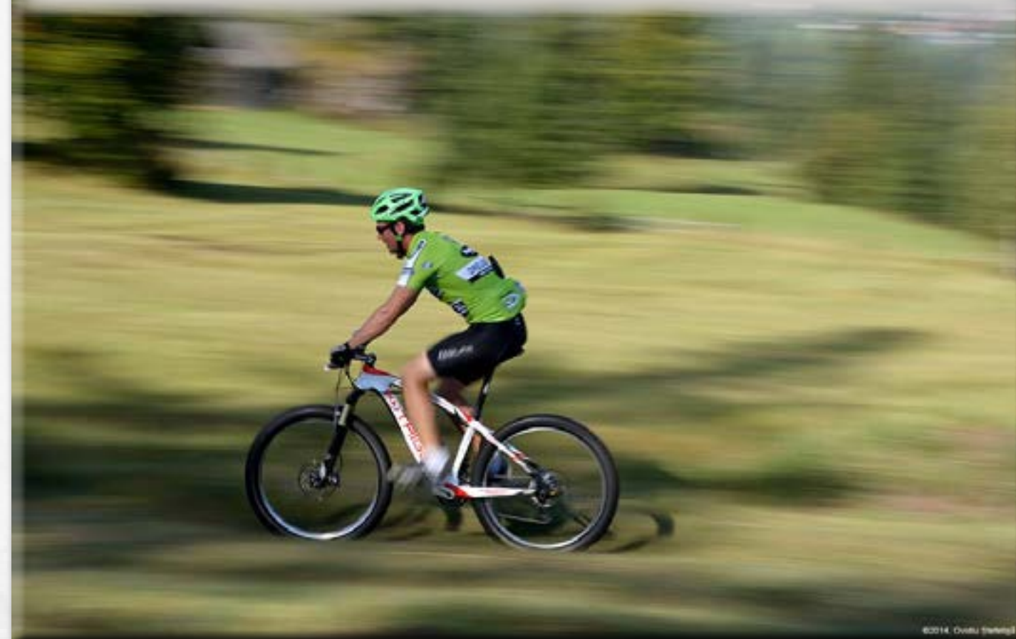
pg#16 - RARAU RADICAL RACE